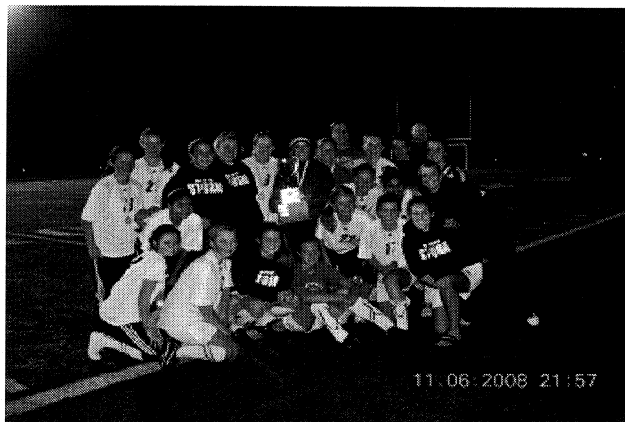
Skyview girls soccer league and district champions 2008 !!!!

More camp info? Current and former Skyview soccer players will be coaching and running the camp. Players will receive both individual and team instruction appropriate at their age level. Skyview instructors will guide the players through small sided games and activities as well as individual and team competitions. The goal is for the girls to improve their soccer skills while making new friends and having a great time.